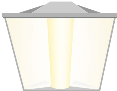
Figure 3: Isometric view of a troffer with a luminous basket and luminous panels on each side. The luminous shape would be represented by a 2D luminous rectangle because a complex shape is not permissible in LM-63.