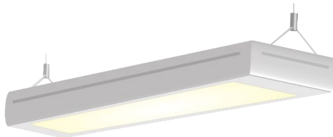
Figure 4: Isometric view of a linear ambient product with a luminous panel at the bottom. The luminous shape would be represented by a 2D rectangle the size of the luminous panel only. If the sides were luminous, a rectangle with luminous sides would be used.