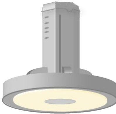
Figure 5: Isometric view of a high bay product with LEDs on the underside. The luminous shape would be represented by a 2D luminous circle, with length and width elements represented as negative values of the respective diameter (see LM-63 for details). If the luminous surfaces were on the sides as well, a vertical cylinder or rectangle with luminous sides would be used instead.